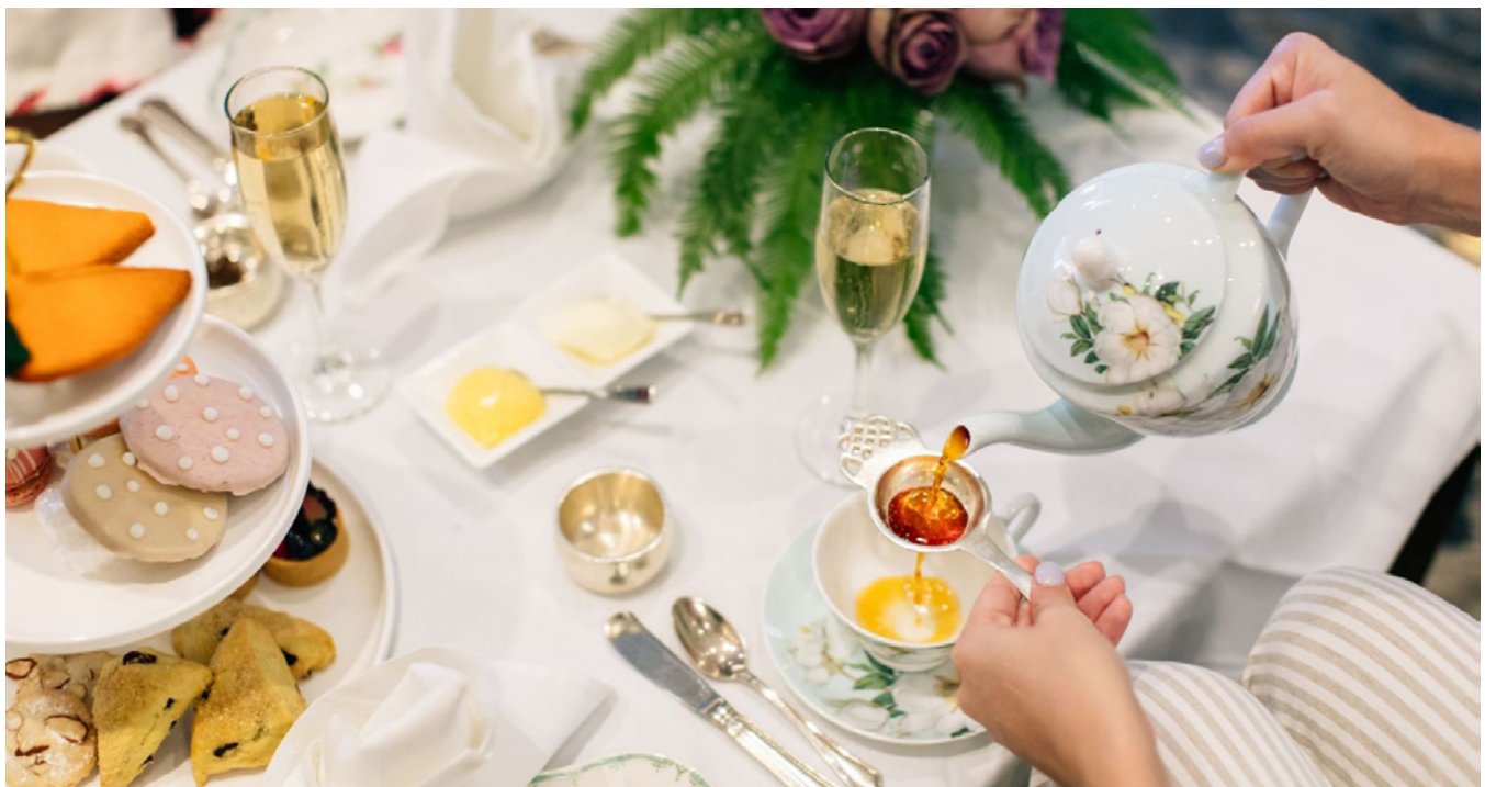
Tea at The Ballantyne (Charlotte, NC)