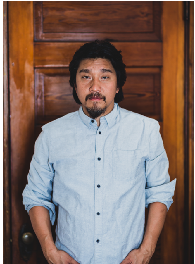
Chef Edward Lee