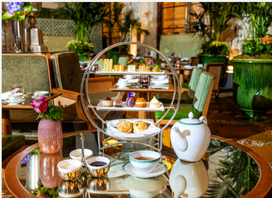
The Plaza Hotel NYC

As demand for low- and no-alcohol options grows, pastry chefs are rethinking teatime as a modern, experience-led alternative to happy hour