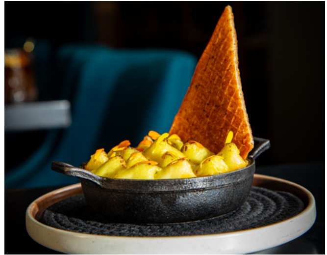
Keema shepherd's pie, Farzi Café (Bellevue, WA)