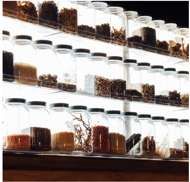
Ingredient Library at Ishtia

As these chefs demonstrate, cooking sustainably does not have to feel restrictive. It can be cost-effective, creative and deeply appealing to guests, while reinforcing the role chefs play in driving meaningful change through carbon negative foods.