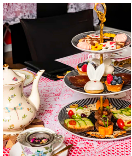
Queen of Hearts tea

See the rest of the questions, finish the quiz and earn four CEHs toward your certification on ACF’s new Online Learning Center at acfchefs.org/olc .