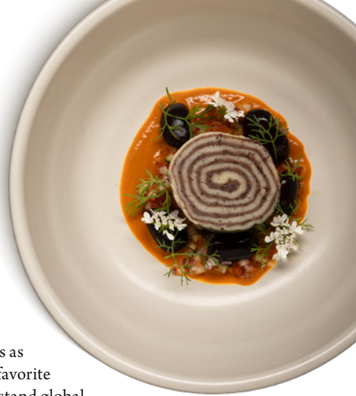
Etix Tamal: red pipián mole, hoja santa, ayocote beans - Valle (Oceanside, CA)