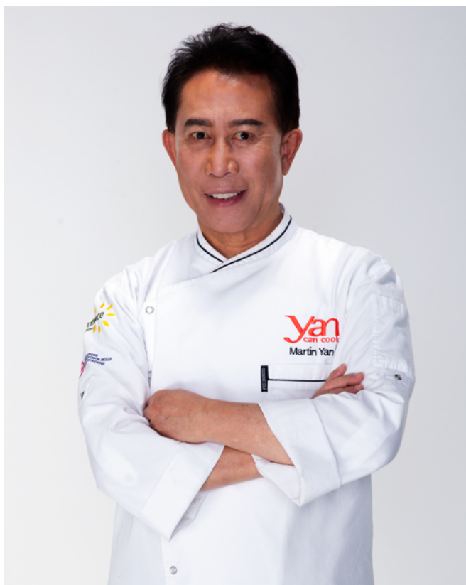
ACF Chef Martin Yan, HAAC, HHOF

For ACF Chef Martin Yan, HAAC, HHOF , Host of Yan Can Cook, this shift is visible and accelerating across the industry. Drawing on decades of global travel, he points to the growing popularity of dishes that are bold, interactive and rooted in tradition. “People are enjoying food that is fun, communal and